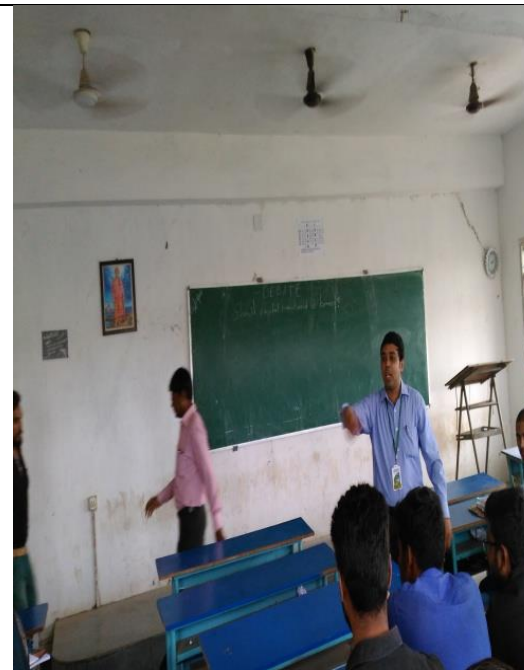
Head of the Department